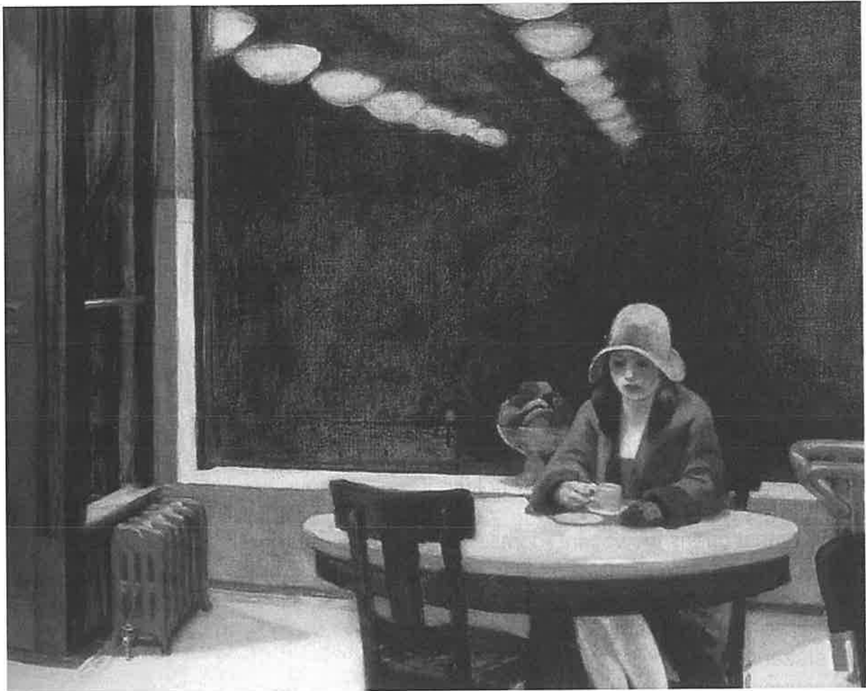
Edward HOPPER, The Automat , 1927 Oil on Canvas, Des Moines Art Center, Iowa (USA)